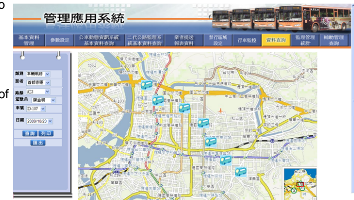
Data Query Sub System allows the competent authorities to query each driver's data.